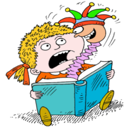
God's Word contains many surprizes Sorprendido